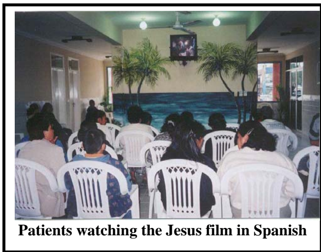
Patients watching the Jesus film in Spanish