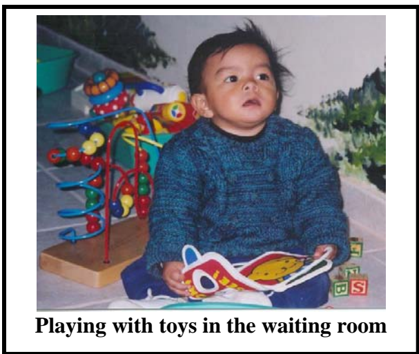
Playing with toys in the waiting room