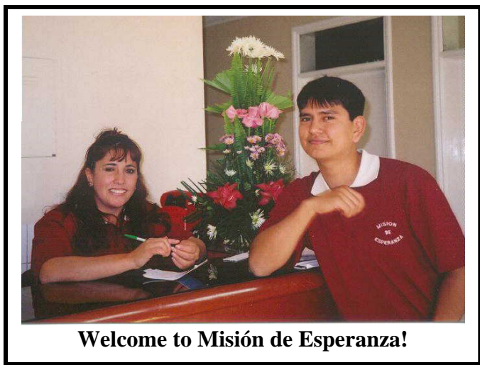
Welcome to Misión de Esperanza!

We are happy to report that the container of medical equipment and supplies arrived in Santa Cruz in record time, and many of those items are now being used in the clinic . We praise the Lord that not one item was lost or stolen, and no bribes were paid! Plans are now underway to send a second container in the fall.