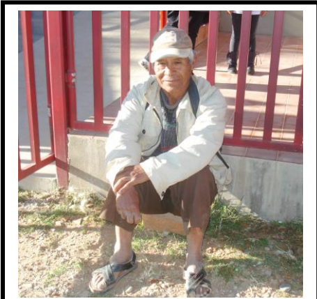
Waiting for the clinic to open