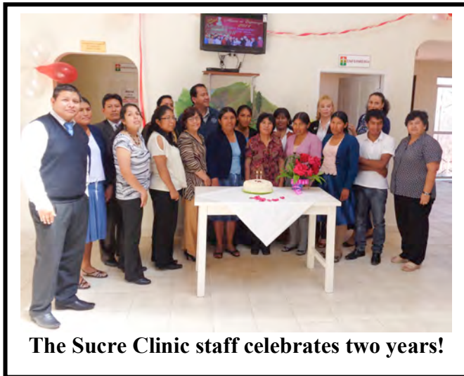
The Sucre Clinic staff celebrates two years!